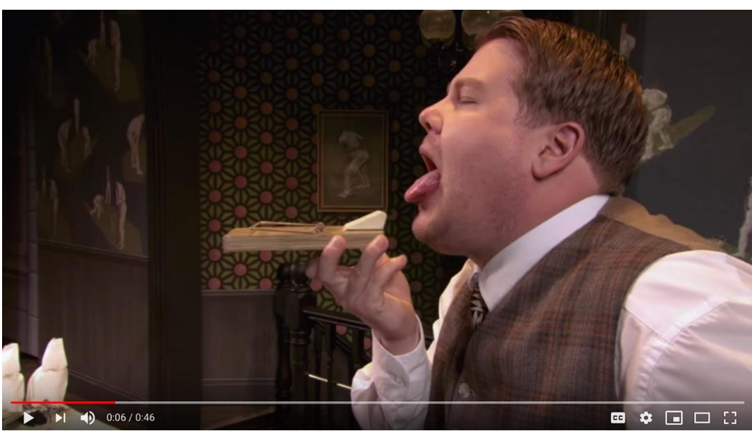
Here's a trailer of the comedy 'One man, Two Guvnors'