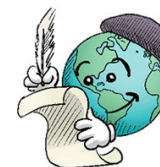
World Poetry Day

Competition opens: 20th March Competition closes: 5th April